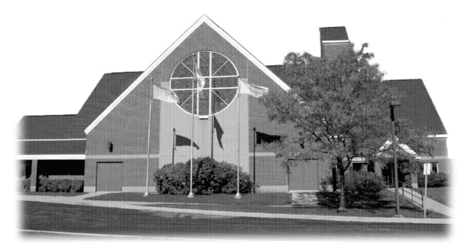
"... The seed is sprouting and growing ..." (Mark 4:27)

ST. VINCENT DE PAUL – White Box Collection on the last Sunday of the month. Call 519-571-8485 for information on food distribution.